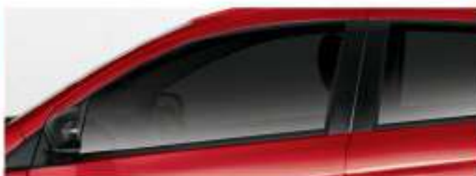
Black Painted Door Mirror and B-Pillar Black Sash