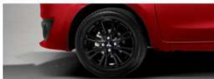
"15 All Black Alloy Wheels