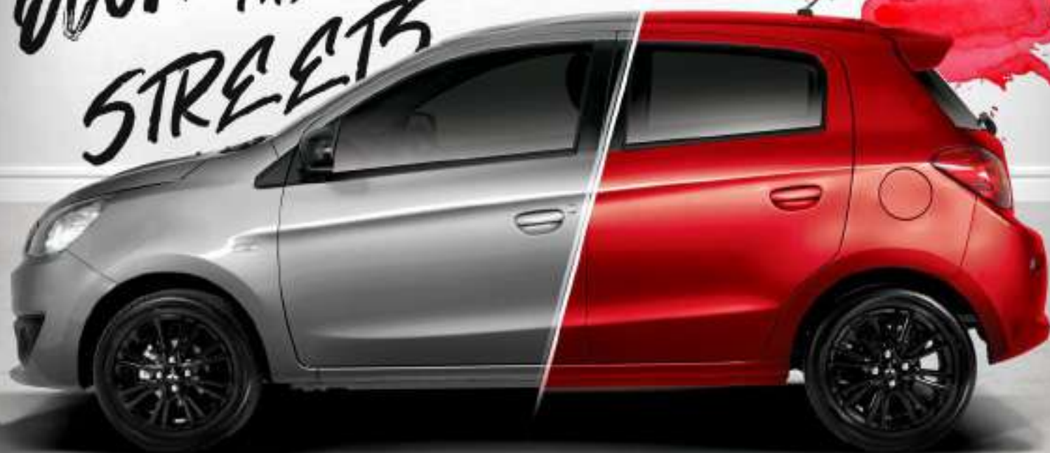
Titanium Gray Metallic